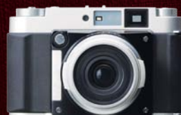
PHOTO CONTEST WINNERS Pages 8-9