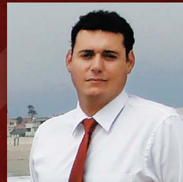
State Senate – District 19

The best way to insure that elected officials are going to understand your issues is to elect one of your own. This year, three CPF members are engaging the fight by running for a high-profile elective office. If you see these names on the ballot, you've got a friend.