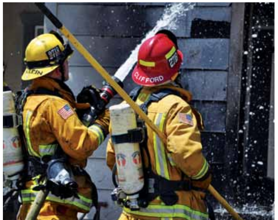
Local F-85 crews conduct overhaul ops at a recent house fire.