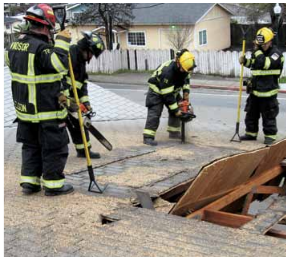
Windsor firefighters on the job. This small Northern California local has fared better during the economic downturn than many of its neighboring locals.