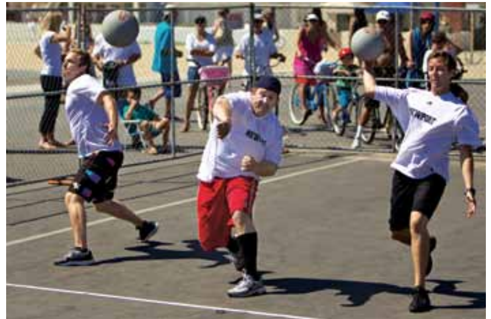
Newport Beach firefighters play dodgeball at the California Firefighter Summer Olympics.

All of the proceeds from the Olympics were donated between the Children's Hospital of Orange County, Grossman Burn Foundation, the City of Newport Beach Parks and Recreation Department and the Newport Beach Firefighters Association Benevolent Fund, which is a 501(c)(3) organization.