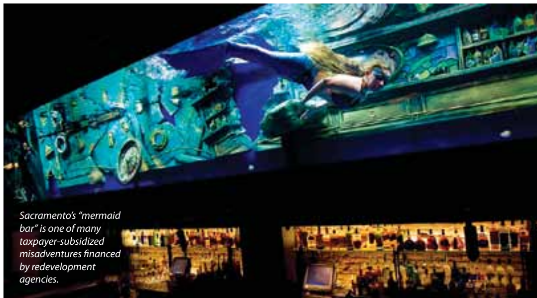
Sacramento's "mermaid bar" is one of many taxpayer-subsidized misadventures financed by redevelopment agencies.

D espite some last minute wrangling, the California Legislature has approved a state budget that, for the first time in recent memory, will be signed and in effect before the end of the fiscal year.