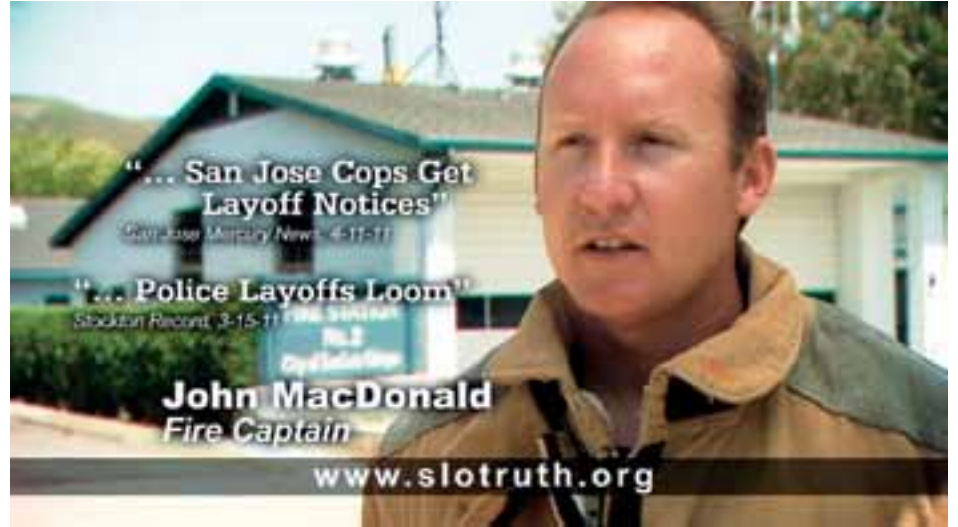
Television and web-based spots - produced by FireStar Productions - emphasized Measure B's public safety risks

District 2 represents CPF Local Unions in the counties of Kern, San Luis Obispo, Santa Barbara, Ventura and Los Angeles - with the exception of United Firefighters of Los Angeles City Local 112 and Los Angeles County Fire Fighters Local 1014.