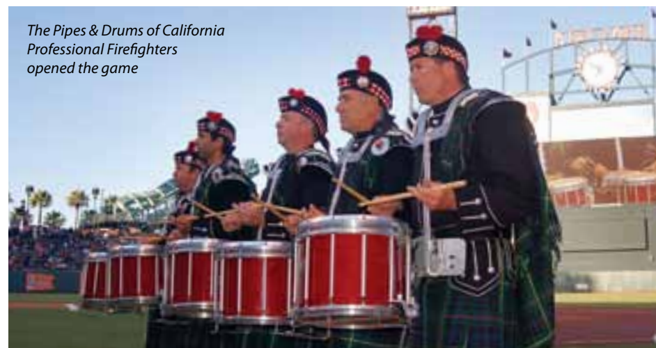
The Pipes & Drums of California Professional Firefighters opened the game

Over 2,000 firefighters were honored before a packed AT&T Park in San Francisco for the San Francisco Giants' Firefighter Appreciation Night.