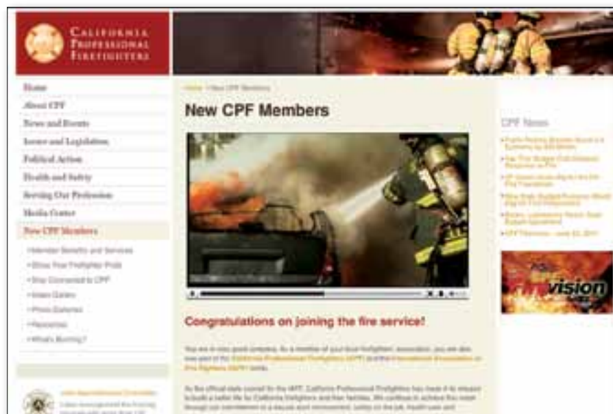
CPF's new member brochure and new member section of CPF.org launched this spring.