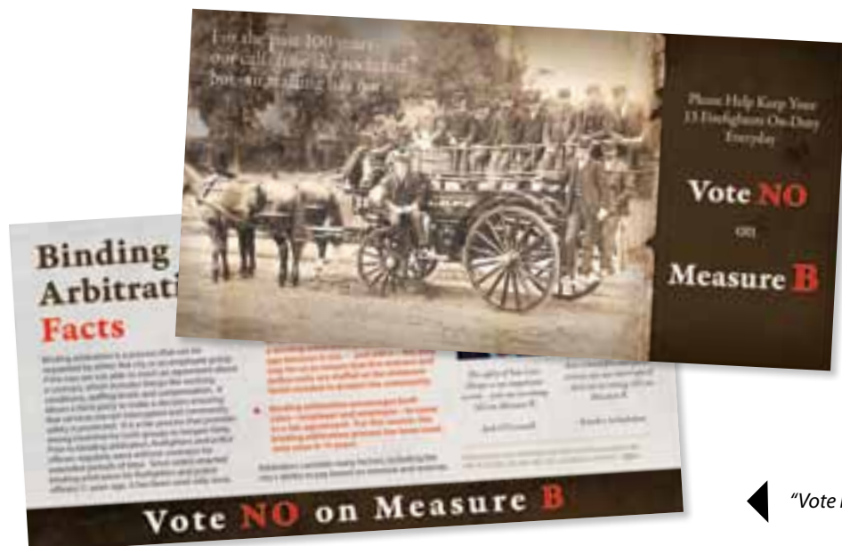
"Vote No on Measure B" mailers were designed by Firefighters Print & Design, www.ffprint.org .

Meanwhile, the city of Montebello remains under investigation from agencies including the U.S. Department of Housing and Urban Development, the Los Angeles County District Attorney's Office and the State Controller's office for mismanaging funds.