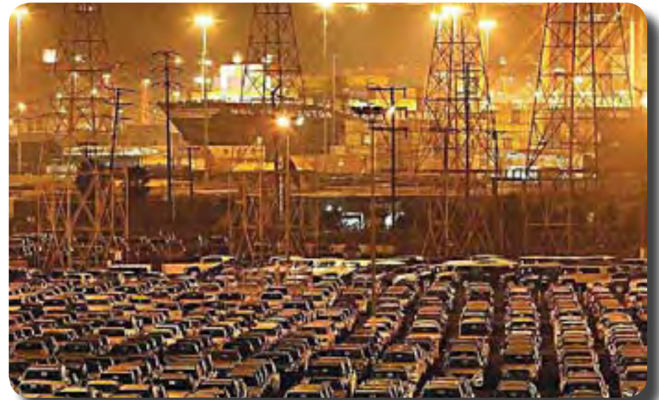
Newly imported cars fill the 150-acre site at the Toyota distribution center in Long Beach, Calif.

San Bernardino City, Ontario, Chico, Lodi, Ventura City are among many locals that have accepted salary concessions to protect jobs.