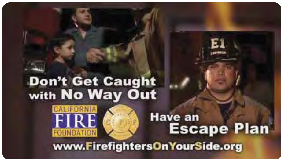
A still from "Firefighters on Your Side" public service announcement