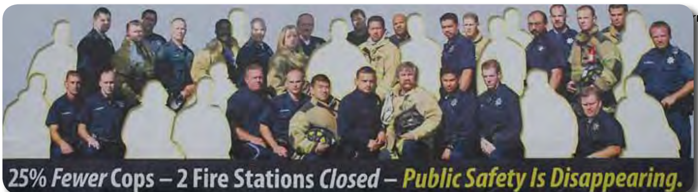
A billboard in Vallejo illustrates one town's diminishing public safety.

"Everything hinges on confidence, sentiment of business, consumers and investors," Zandi told The Bee . "And it won't take a lot to make people feel a lot better."