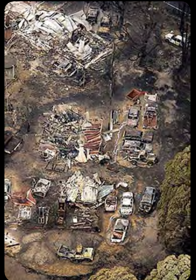
RIGHT: The ruins of buildings and vehicles lie on charred land at Kinglake, northeast of Melbourne, Australia.