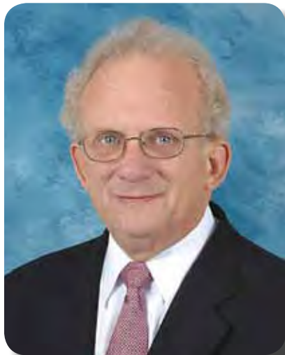
Representative Howard Berman

Important legislation moving through the U.S. Congress needs the support of California's retired firefighters.