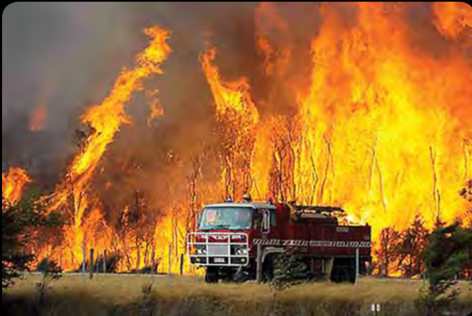
ABOVE: A fire truck moves away from out-of-control flames, part of a wildfire about 78 miles west of Melbourne, Australia.