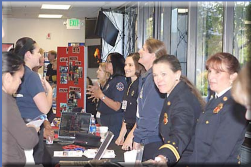
Scene from 2008 Recruitment Fair in Northern California

CLICK HERE TO READ ABOUT THE CFFJAC RECRUITMENT FAIRS