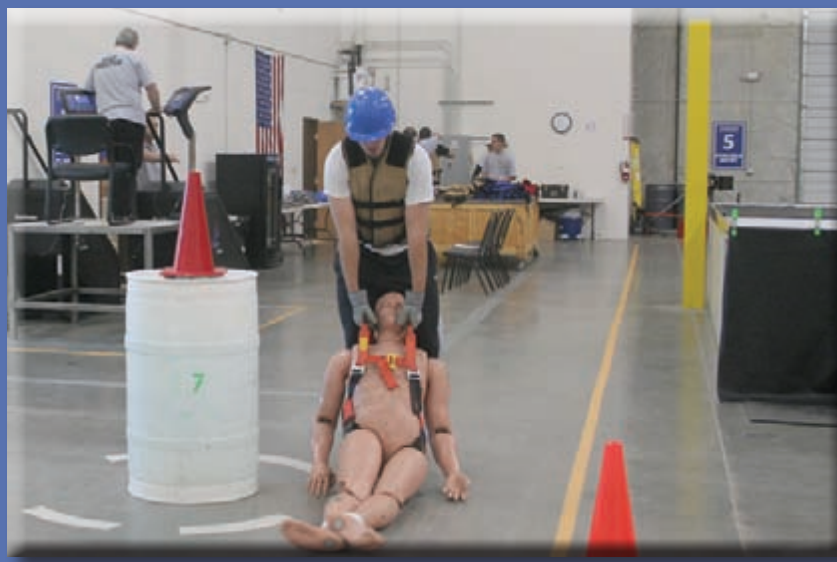
Candidate tests at new CPAT Center in Sacramento