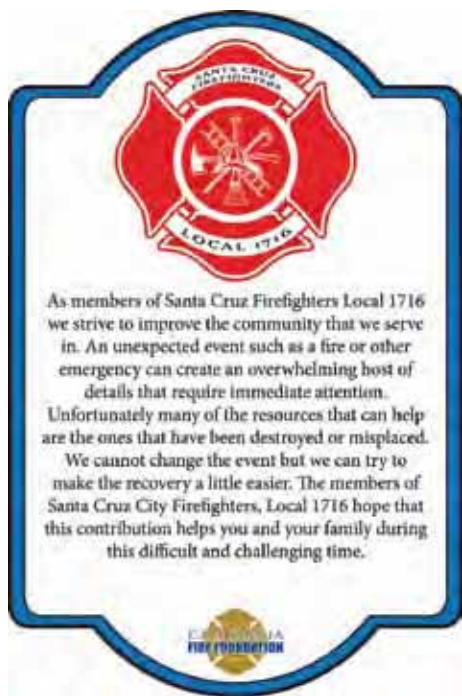
All cash card recipients receive a copy of this letter.