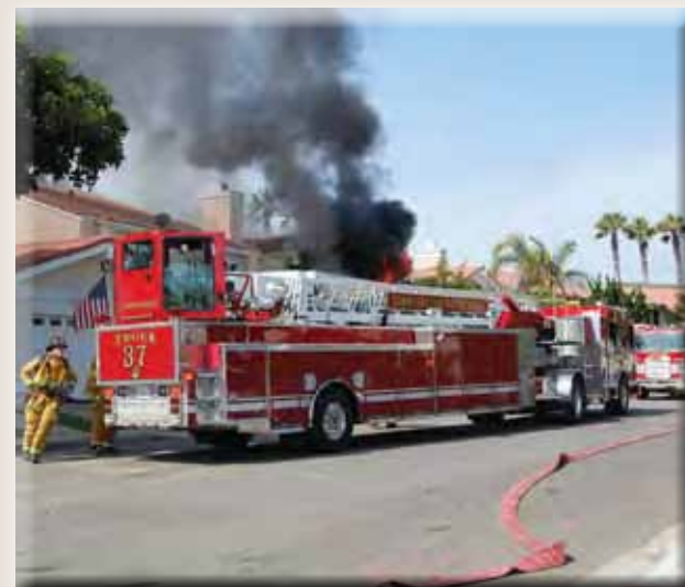
Imperial Beach Fire Department members respond to a house fire in Coronado.

Best known as the most southwesterly city in the continental United States, the coastal city of