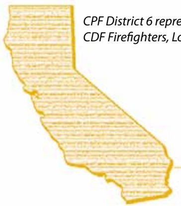
CPF District 6 represents CDF Firefighters, Local 2881