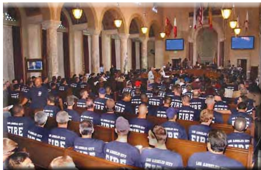
Over a hundred members of Local 112 showed up at a City Council meeting to issue a warning against the pending closures.