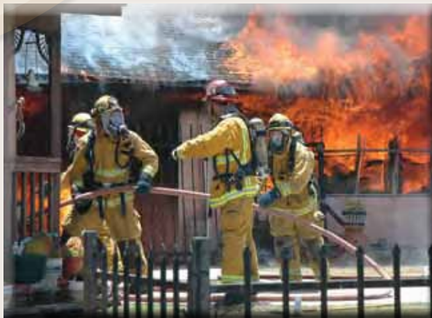
El Cajon firefighters work to extinguish a structure fire.

El Cajon Firefighters Local 4603 joined the IAFF last November and CPF in April.