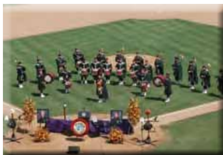
Pipes and Drums of California Professional Firefighters performs "Amazing Grace."