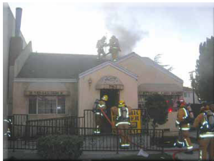
Costa Mesa Firefighters hard at work at a structure fire. The local proposed a four-year contract extension and avoided layoffs and salary/benefit reductions.