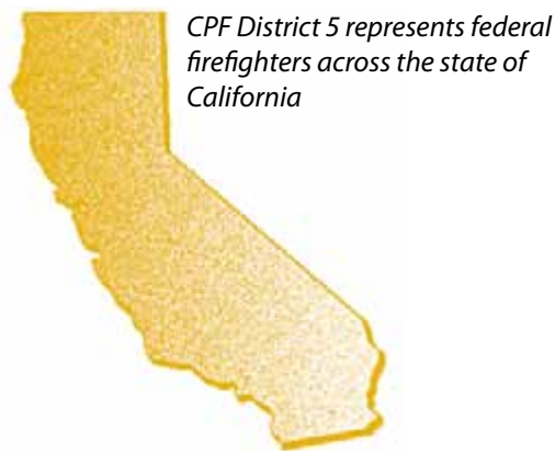
CPF District 5 represents federal firefighters across the state of California