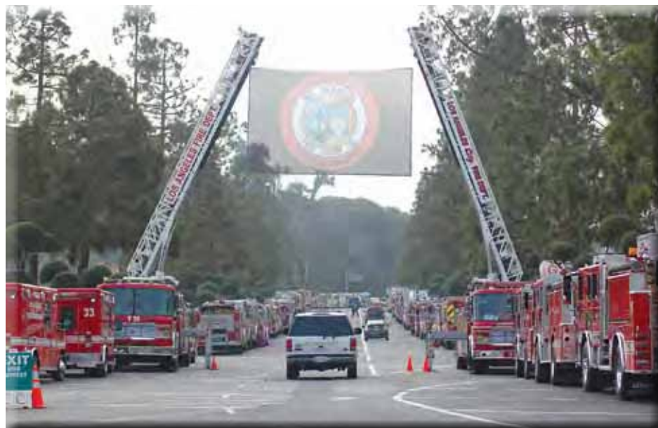
Apparatus from throughout California rings the Dodger Stadium parking lot.