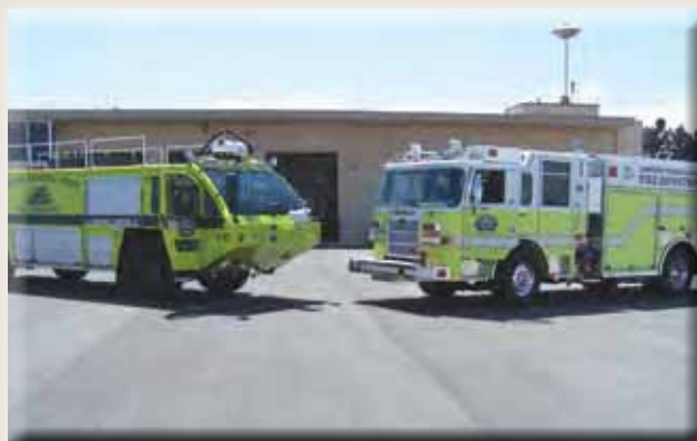
Two trucks from Monterey Airport Fire Department

The Monterey Airport Fire Department is a single station department, which averages 400 to 500 calls each year. The fire department provides crash fire rescue as well as EMS and fire protection services to Monterey Airport. It also has automatic aid agreements with the surrounding jurisdictions, providing service for structure fire and vehicle accidents.