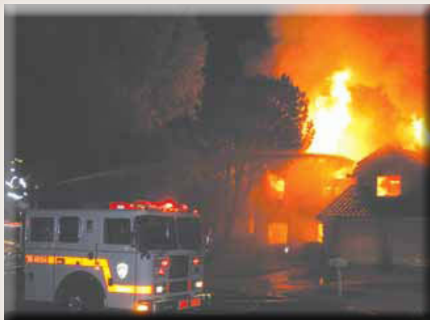
Members of Apple Valley Fire Department hard at work at a structure fire.

Five staffed stations and two unstaffed stations support Apple Valley's population of 90,000 as well as its surrounding communities. Apple Valley Fire Department provides fire and EMS services, as well as hazmat and an urban search and rescue team. In addition, Apple Valley has recently obtained a state engine to increase mutual aid assistance across the state.