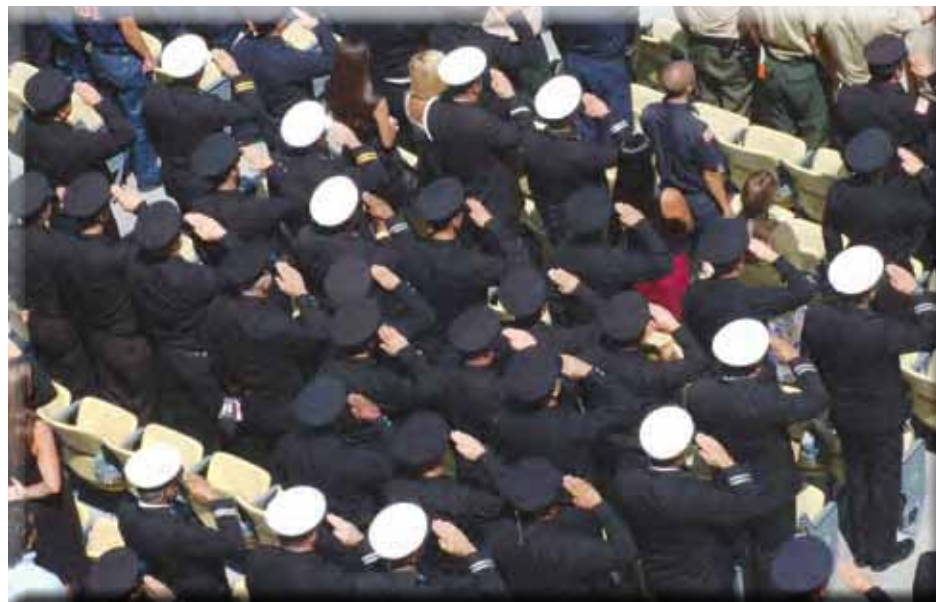
Firefighters salute during "Taps" for fallen colleagues.

Agencies from throughout the nation gathered among the roughly 8,000 people in attendance. About 300 pieces of apparatus from dozens of departments encircled the sprawling park, and honor guards from dozens of departments from California and the nation participated.