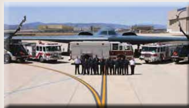
Members of Local I-25 at Palmdale Airport.

Current goals for Local I-25 include improving their living conditions; getting the rest of the firefighter presumptions for their membership; and working with their congressman to change the McNamara-O’Hara Service Contract Act (SCA). The SCA already ensures that contractors performing services on covered federal contracts cannot offer service employees less pay, benefits, or safety and health standards than what they already receive. But Local I-25 would like to ensure that service employees have first right of refusal before a new contractor can bring in new hires to replace them.