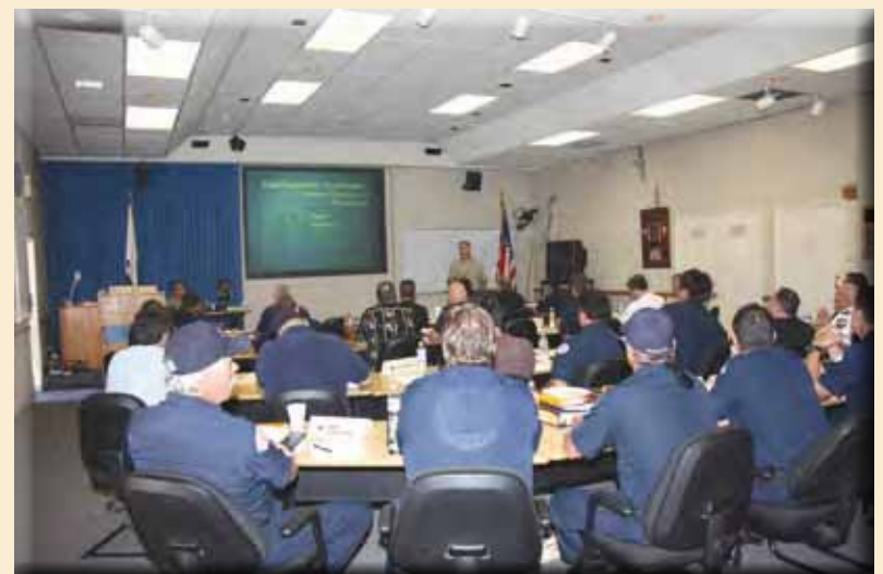
Attendees get an overview of TCM protocols at the TCM Train-the-Trainer class in Long Beach.

Visit www.cffjac.org to view the dates and locations for upcoming TCM classes, as well as registration information.