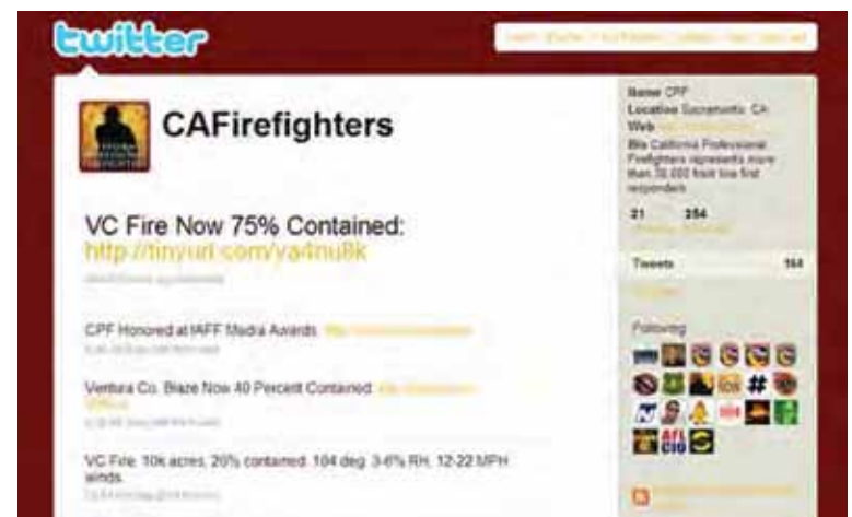
CPF's Twitter page features quick updates on our latest news.

www.cpf.org Still your central source of information on all things relating to firefighters and their families. Our “Find it Here” section on the CPF home page takes you to locations of greatest interest and links to other CPF locals. You can also link up with other CPF-affiliated sites ( www.cffjac.org ; www.cafirefoundation.org ; www.ffprint.org ; www.firestarproductions.org ).