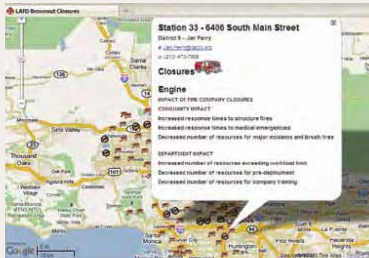
UFLAC.org includes a map with every Los Angeles City fire station and an icon for those with reduced staffing.

If your local is doing something interesting to communicate – whether it’s incident communications, public relations or spreading your labor message – drop us a line and let us know – info@cpf.org .